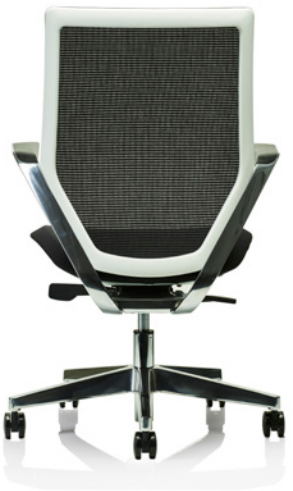
White backrest frame