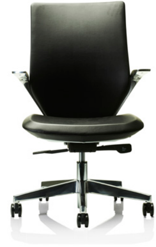
Commercial PU or cowhide leather all over upholstery