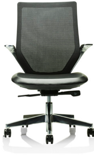
Commercial PU or cowhide leather seat