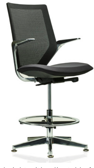
Extra height with adjustable foot step