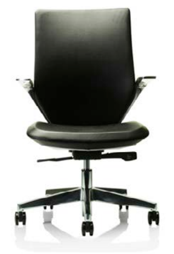
Commercial PU or cowhide leather all over upholstery