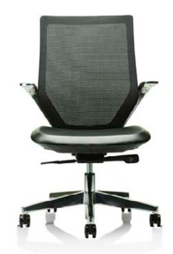
Commercial PU or cowhide leather seat